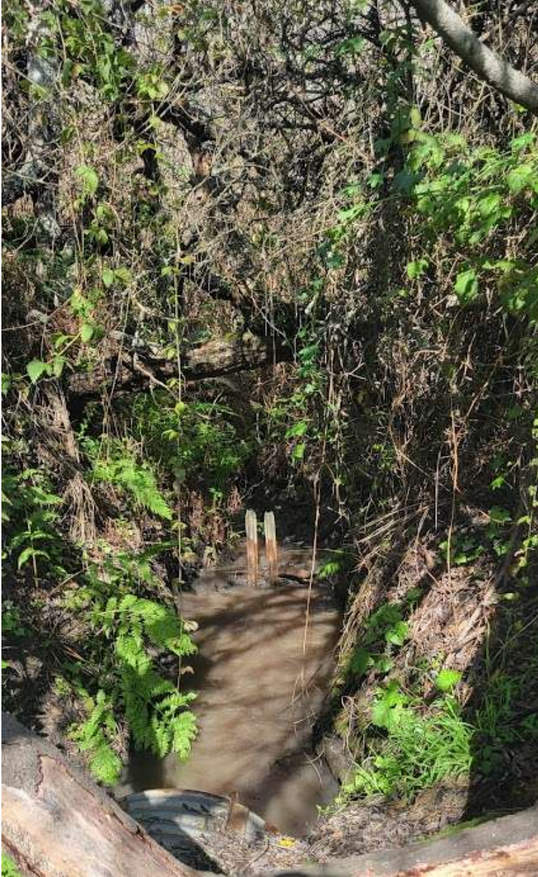
Exhibit E. San Agustin creek just before diversion into underground culvert at Balboa. Willow trees, ferns, and lush vegetation. The creek empties into the harbor next to Barbara's Fish Trap. February 8, 2025.