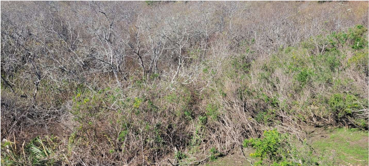
Exhibit H. First photo looks toward numeral 1 on the street. Second photo looks straight out from our window to the willows, with a small amount of uncleared French Broom in the foreground. The willows are just starting to show their new leaves and catkins. February 9, 2025.