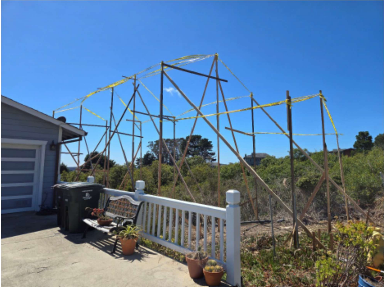
Exhibit F. Photo taken from application shows the story poles in the foreground and the nearby willow thicket behind. The willows in background right are at approximately the location of numeral 1. Photo unknown photographer and date between September and January.

Photo from developer's application showing "Left View" of story poles with willow thicket in background