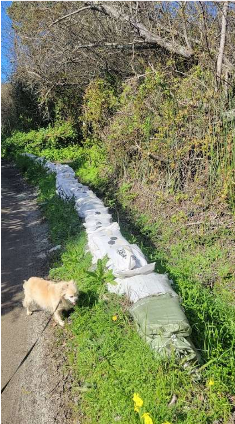
Exhibit D. Sandbags on Balboa, ready for winter rainfall. Our tiny dog Charlie for perspective. Willow trees and horsetail in the vegetation on the right. February 8, 2025.

Photos from Numeral 2 showing sandbags, wetland vegetation, multiple drains, and the main creek channel