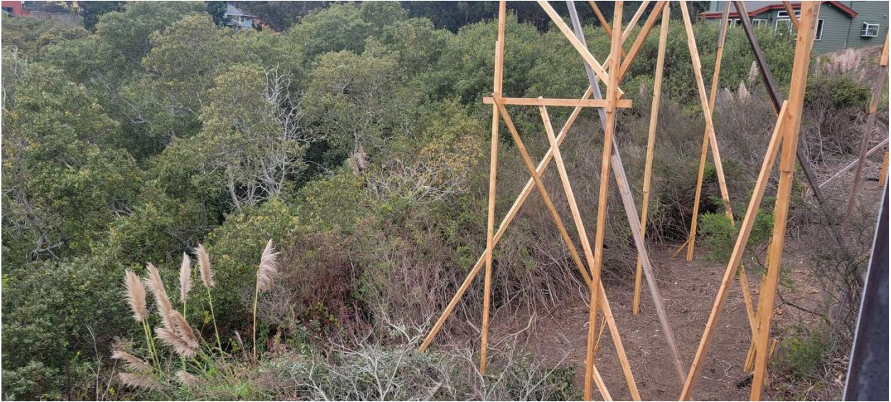
Exhibit G. View from our family room with story poles in foreground and willow branches almost touching rear of structure. Photo Richard Klein September 28,2024.

Photos of the lot and the adjacent willows from our family room.