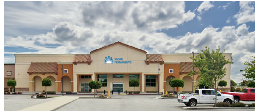
Artist's rendering of new Salinas Medical Offices

Kaiser Permanente's newest medical offices will feature Adult & Family Medicine, Pediatrics, Ob-Gyn, Dermatology and other specialty services to be determined. The Salinas Medical Offices will also provide Radiology, Pharmacy and Laboratory services.