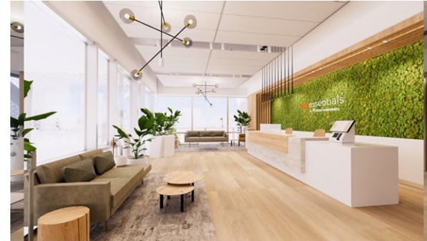
Care Essentials in the heart of downtown San Francisco.