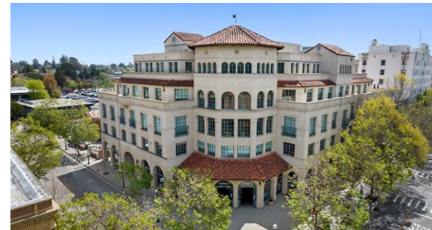
At the new Santa Cruz Medical Offices, members have access to family medicine, lab, mammography, ob-gyn, pediatric, pharmacy, and X-ray services.