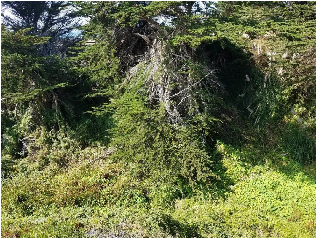
Photo 1. View of lighter green vegetation below taller darker green Monterey Cypress trees. Riparian boundary runs along approximately the lower 1/3 of the photo. Photo date: 09/14/2017.