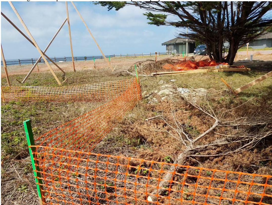
Photo 6. View of property where brush was mowed and story poles were erected. Monterey Cypress Tree on right side of photo would be removed as part of project. Photo date: 09/14/2017.