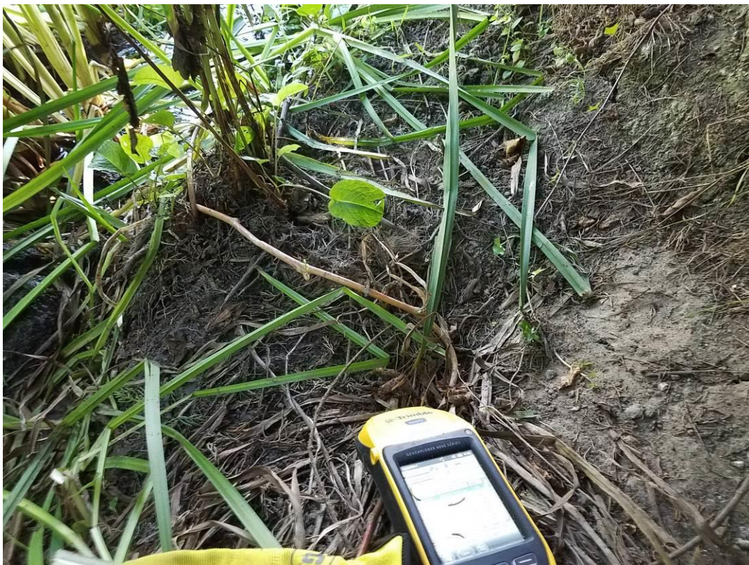
Photo 2. Far right side of photo shows boundary between riparian floodplain and upland at Dean Creek. Photo date: 09/22/2017.