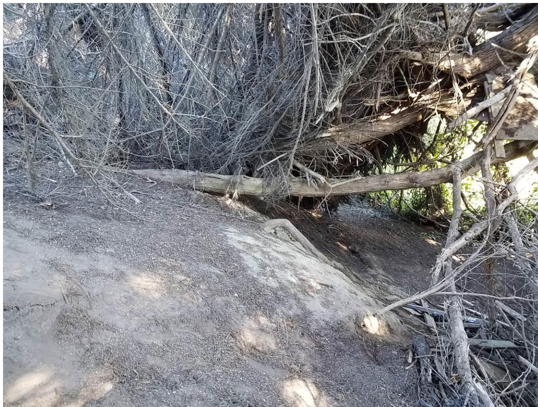
Photo 3. Understory vegetation is lacking on the steep slope underneath the Monterey Cypress trees. Photo date: 09/14/2017.