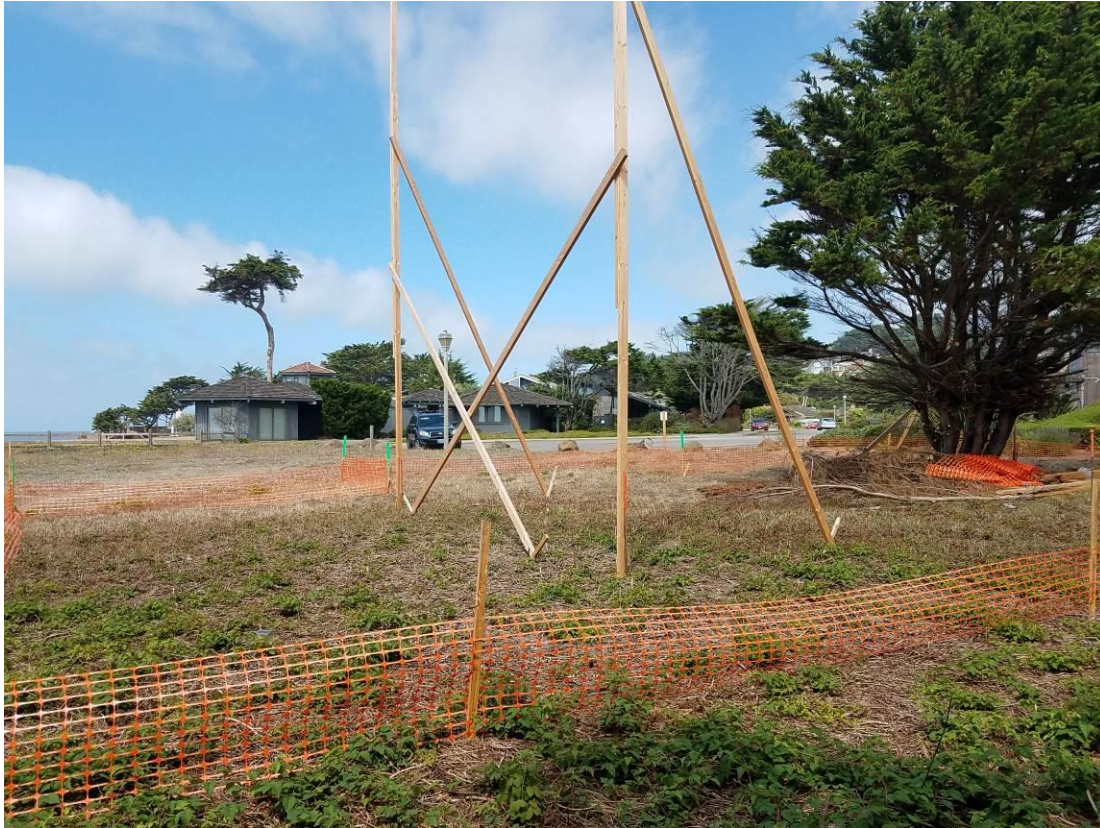
Photo 5. View of property where brush was mowed and story poles were erected. Monterey Cypress Tree on right side of photo would be removed as part of project. Photo date: 09/14/2017.