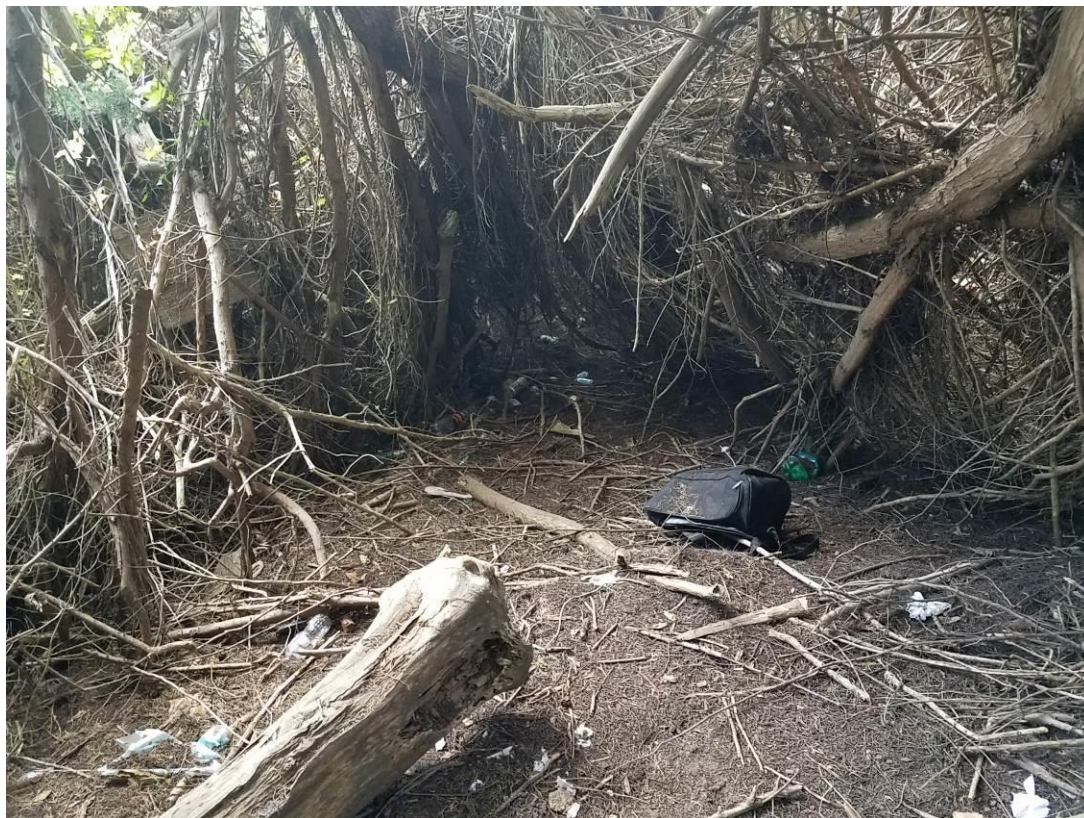
Photo 4. Understory of Monterey cypress trees. Photo date: 09/22/17.